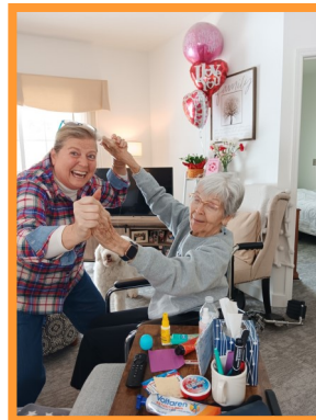
Most days are made For DANCING!